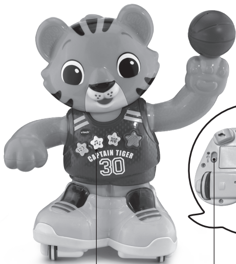
Four Star Buttons

Thank you for purchasing the VTech® Dribble & Bounce Tiger™! Be on the winning team with the Dribble & Bounce Tiger™! Get warmed up as Tiger shows off impressive ball skills by dribbling and spinning the basketball. Then, play some defense and try to catch Tiger while moving around obstacles, getting little ones up and going. What a slam dunk!