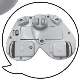
On/Off /Mode Switch